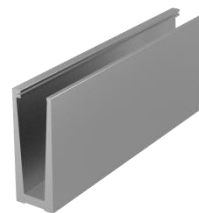
Base Fix Channel