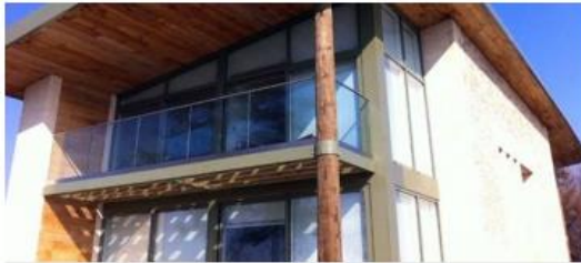
Frameless Glass Balustrade Systems